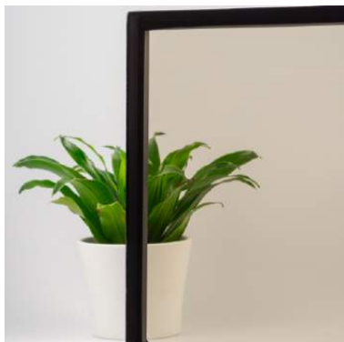
Bronze solar control Tinted glass providing solar control to help prevent overheating