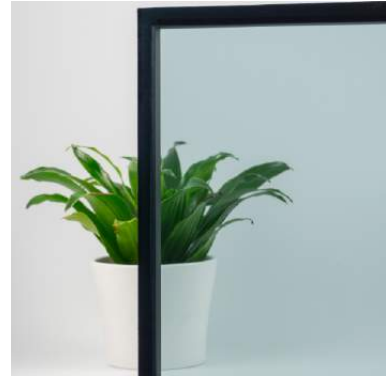
Blue solar control Tinted glass providing solar control to help prevent overheating