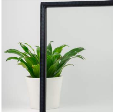
Clear standard Standard clear glass providing maximum light transmission