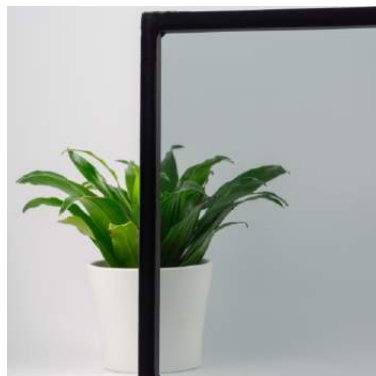
Grey solar control Tinted glass providing solar control to help prevent overheating