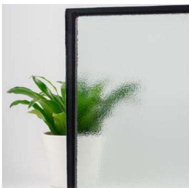
Textured obscure Textured glass providing high light transmission with privacy