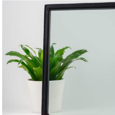
Neutral solar control Neutral appearance glass providing high light transmission, and solar control to help prevent overheating