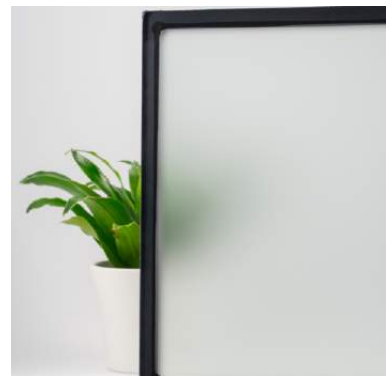
Satin obscure Smooth frosted glass providing high light transmission with privacy